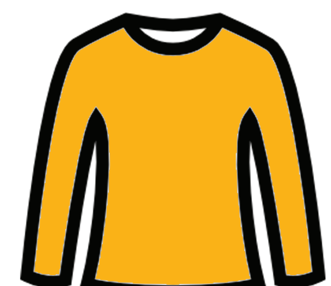
DRI-FIT COMPRESSION SHORTS/SHIRTS